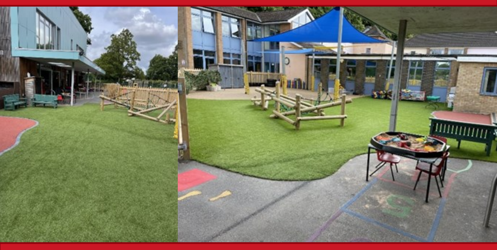
Our shared outdoor space