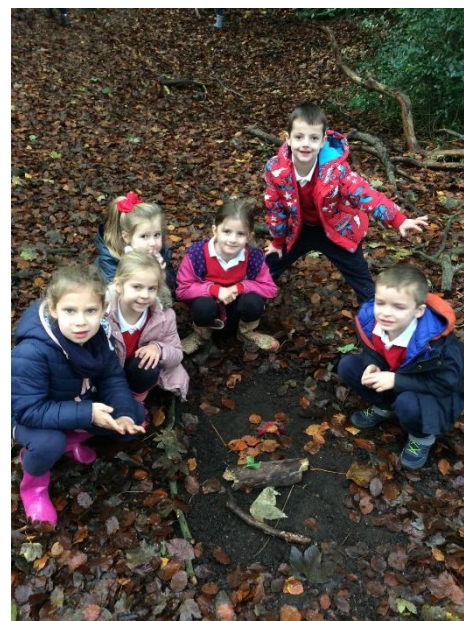
Year 1's Autumn Walk learning about our local area