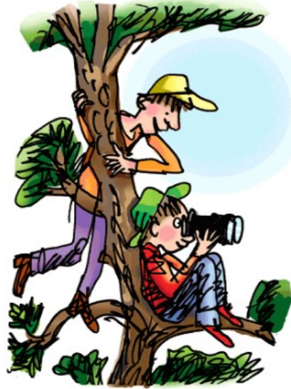
what can you see?

2. day , play , may , way , lay , say , tray , spray