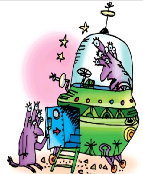
shut the door

2. car , bar , star , park , smart , start , sharp , spark