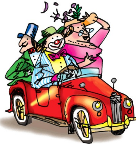
start the car

2. took , look , book , shook , cook , foot