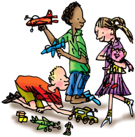
may I play?

2. day , play , may , way , lay , say , tray , spray