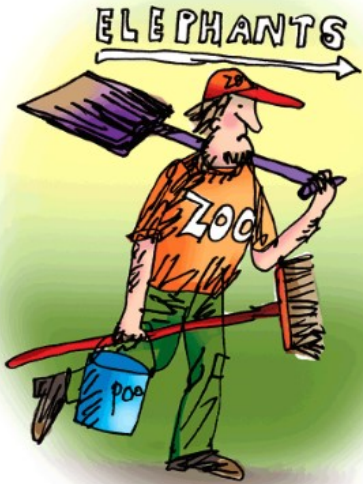
poo at the zoo

2. blow , snow , slow , show , know , flow , glow might