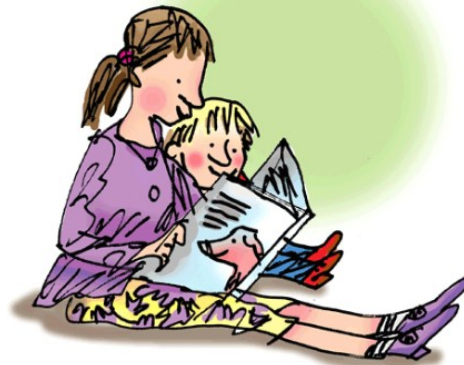
look at a book

2. too , zoo , mood , fool , pool , stool , moon , spoon