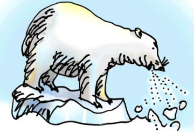
blow the snow

2. high , night , light , fright , bright , sight , might