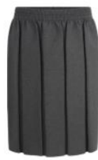
Grey Box Pleat Skirt