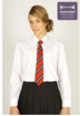
Pack of 2 Long Sleeve Polycotton Easycare White Blouses by Trutex