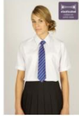
Pack of 2 Short Sleeve Polycotton Easycare White Blouses by Trutex