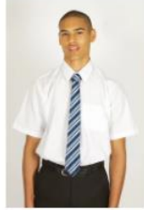
Pack of 2 Short Sleeve Polycotton Easycare White Shirts by Trutex