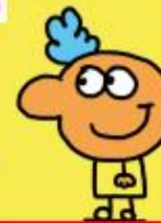
Illustration from My Big Fat Smelly Poop Diary © Jim Smith, 2024